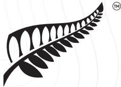
NEW ZEALAND FOREIGN AFFAIRS & TRADE