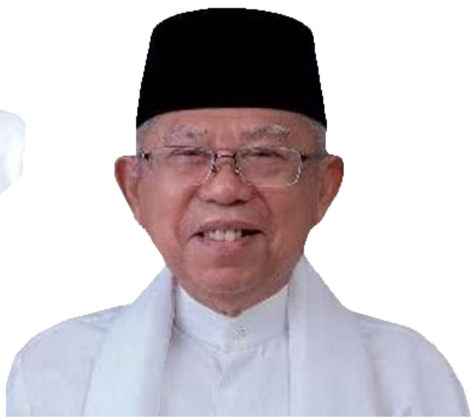
Joko Widodo's running mate